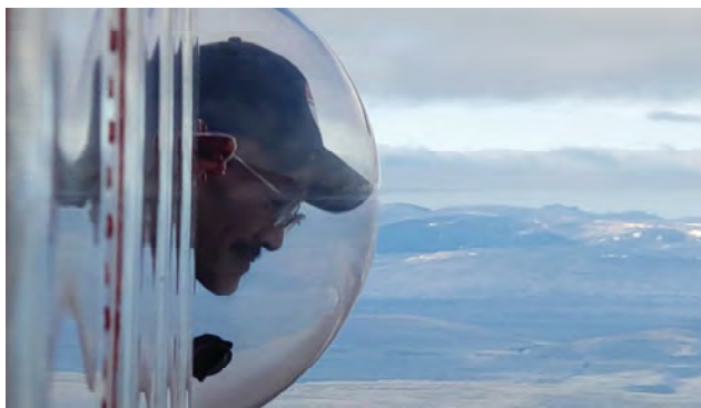
Marine Mammal Aerial Surveys

Monitors the abundance and distribution of narwhal and other marine mammal species in Project area throughout the summer.