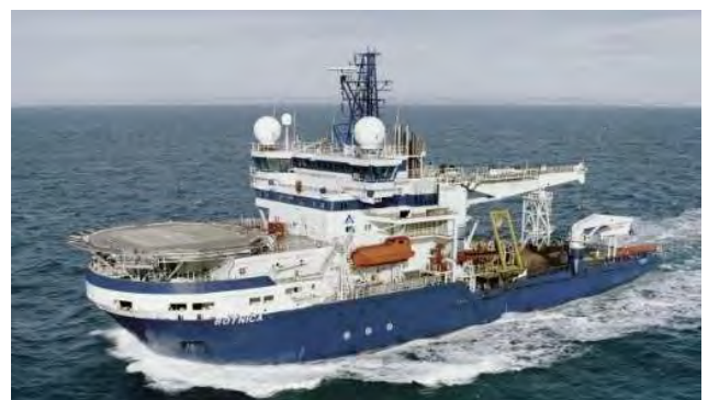
Shipboard Observer Monitoring

Monitors water and sediment quality including metals, benthic infauna, epifauna and epiflora, fish abundance and health (focus on Arctic char) including contaminant analysis, and ballast water compliance testing.