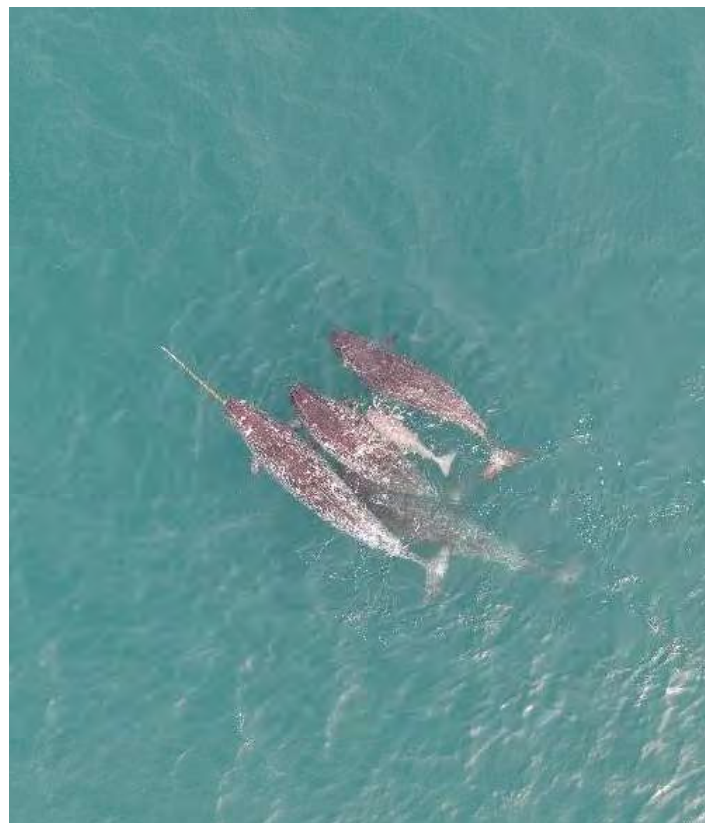
Five Narwhal Observed in Milne Inlet (4 August 2022) at a Distance of 4 Km from a Southbound Vessel