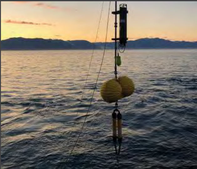
Passive Acoustic Monitoring

Potential monitoring of underwater noise at two (2) locations near Bruce Head and Ragged Island. Acoustic recorders will be deployed in late July, 2023 and retrieved in October to download data from the shipping season. Both recorders will be re-deployed in October to overwinter during 2024 and capture icebreaker transits at the end of the 2023 shipping season. This program is contingent on whether cape-sized vessels will be used throughout the 2023 shipping season.