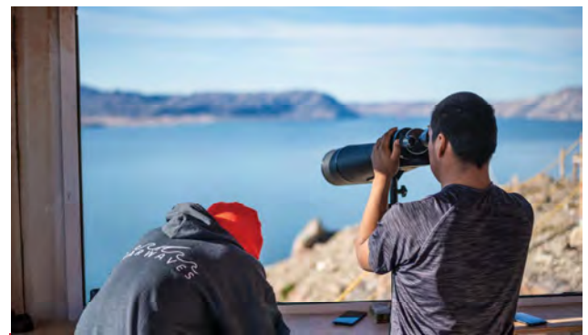
Bruce Head Shore-based Monitoring

Monitors the abundance and distribution of narwhal and other marine mammal species in Project area throughout the summer.