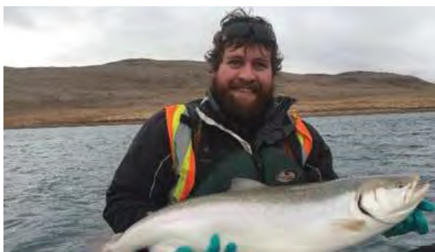
Marine Environmental Effects and Aquatic Invasive Species and Habitat Offset

Investigates narwhal response to shipping along the Northern Shipping Route by observing them from the top of Bruce Head.