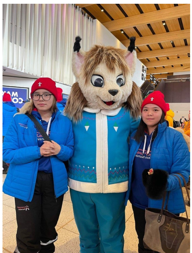
Posing with AWG Mascot, Titotem the Lynx