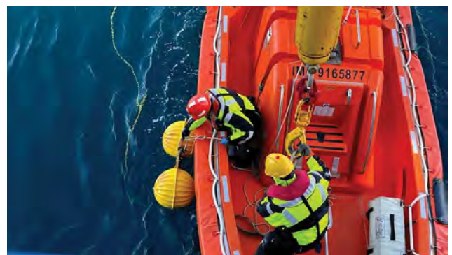
Passive Acoustic Monitoring

Monitors water and sediment quality, including metals, benthic infauna, epifauna and epiflora, fish abundance and health (with a focus on Arctic char) including contaminant analysis, and ballast water compliance testing.