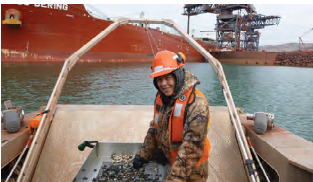
Marine Environmental Effects and Aquatic Invasive Species and Habitat Offset

Investigates narwhal response to shipping along the Northern Shipping Route by observing them from the top of Bruce Head.