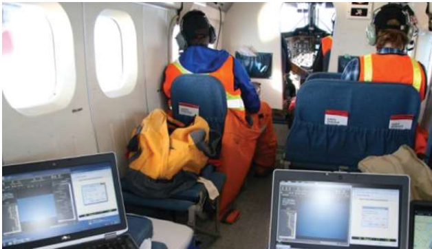
Marine Mammal Aerial Surveys

Monitors the abundance and distribution of narwhal and other marine mammal species in Project area throughout the summer.